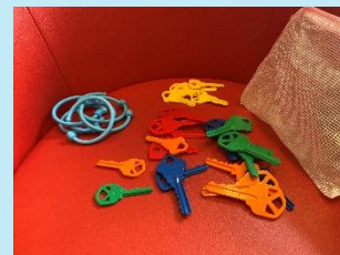
Matching and Sorting

Check out our Youtube or Facebook for videos 😊 Fine Motor